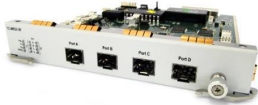
2.7 Gbps Multi-rate Transponder TC-MR-25-3R