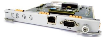
Management Card TC-MNG-T