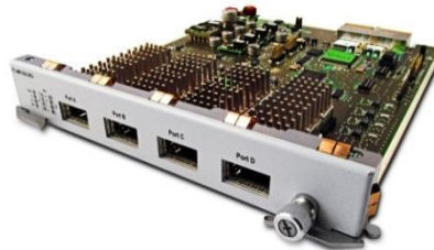
11.3 Gbps Multi-rate Transponder TC-MR-100-3RD